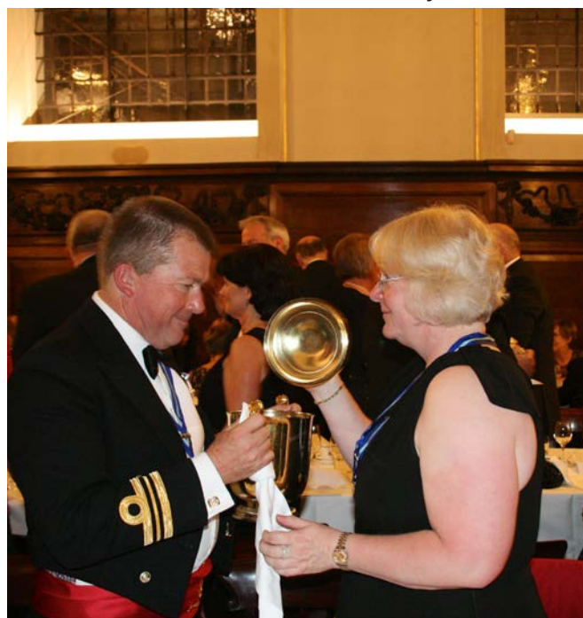
The loving cup ceremony