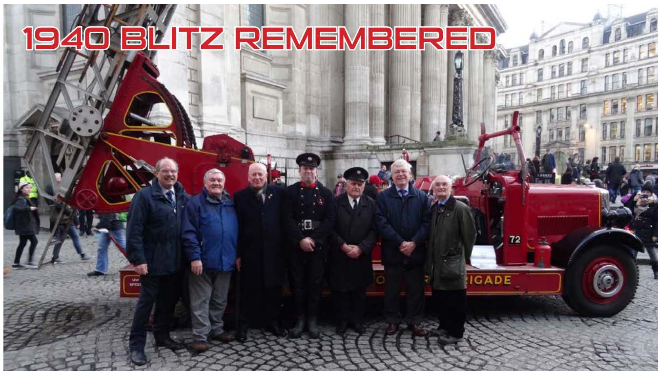
Worshipful Company of Firefighters with a 1937 Leyland Metz 100 ft TTL in the background

On Tuesday 29th December, the Fire Service Preservation Group held an event to mark the 75th anniversary of the biggest Blitz raid on London. Two fire appliances were on show outside St. Paul's. There were also events at Dowgate Fire Station on Lower Thames Street. At 18:15, the siren sounded and the appliances went on a circuit of the City "on the bell".