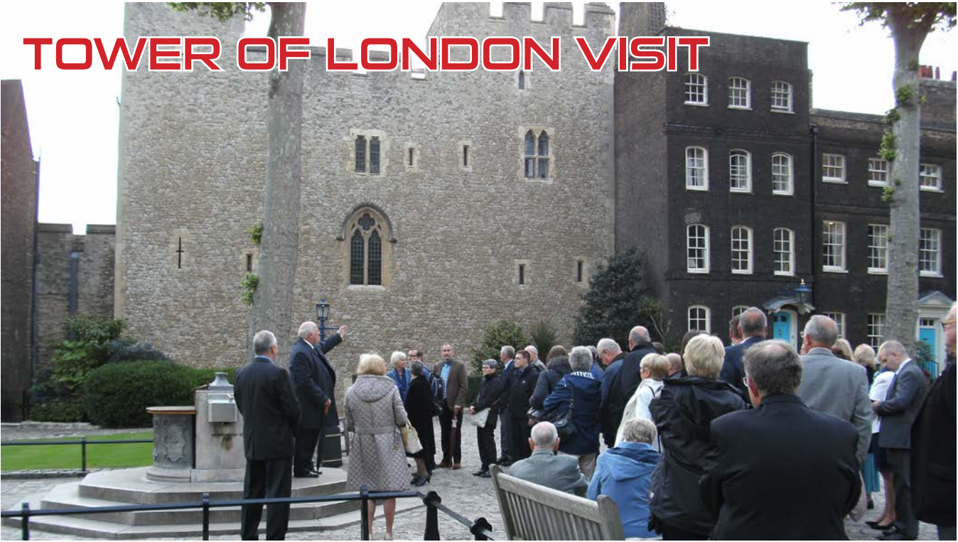
Firefighters Company members have a unique private tour of the tower of London

On the 21st May 2015, members and guests had a wonderful evening privately touring the famous Tower of London to see the ceremony of the Keys.