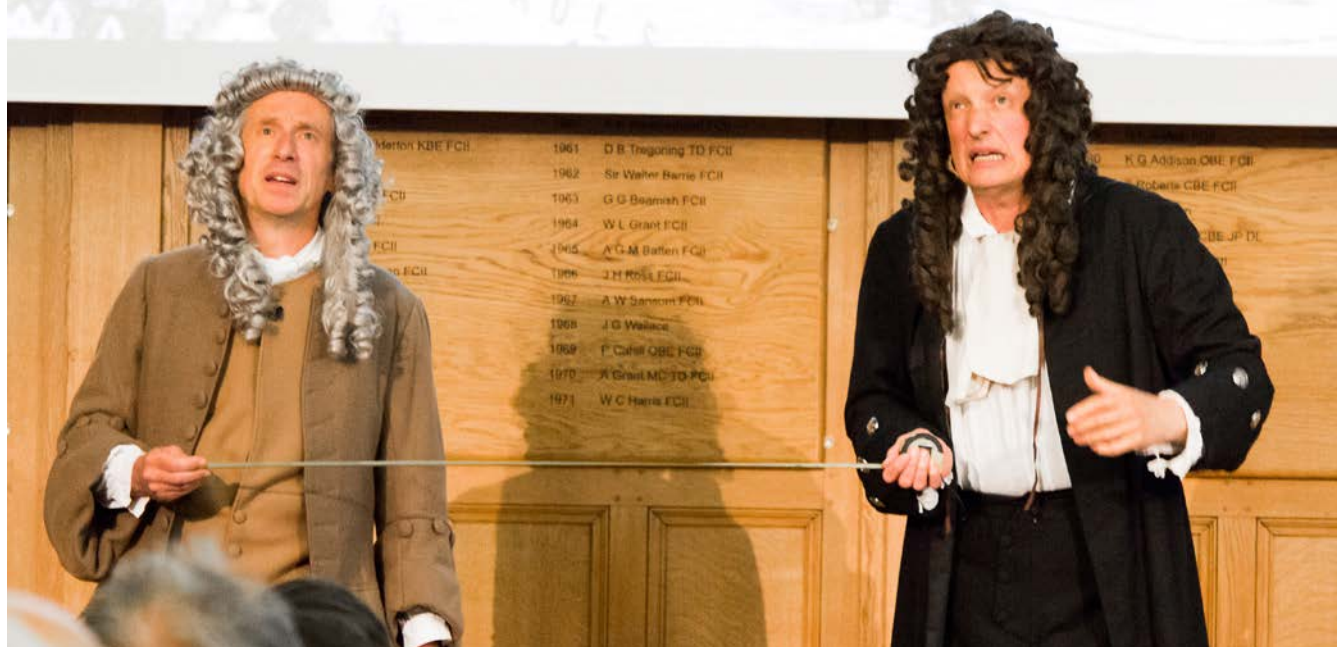
The Fire Lecture 2016 remembered the Great Fire of London 1666

The 6th Annual Fire Lecture was held at the Insurance Hall during the evening of the 7th July. Samuel Pepys, Christopher Wren, John Evelyn, Nicholas Barbon, Robert Hubert and Thomas Farynor, cleverly portrayed by artists of Spectrum Drama, enthusiastically entertained an almost capacity audience, reliving the life and times of 1666.