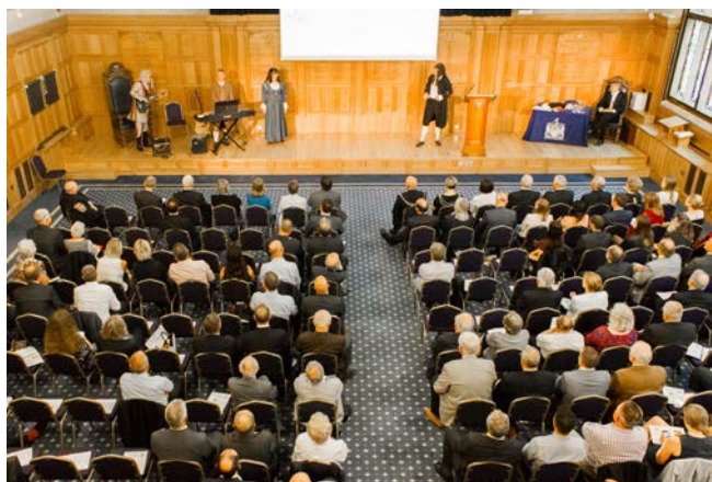
An audience from a great number of sectors within the fire industry enjoying the presentation of the play.