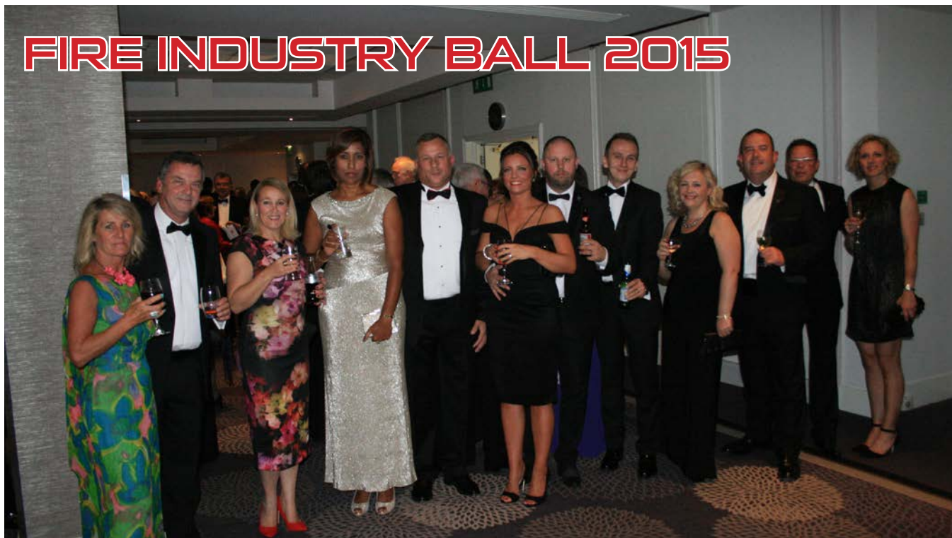
Guests enjoying the reception drinks and wine prior to the Fire Industry Charity Ball