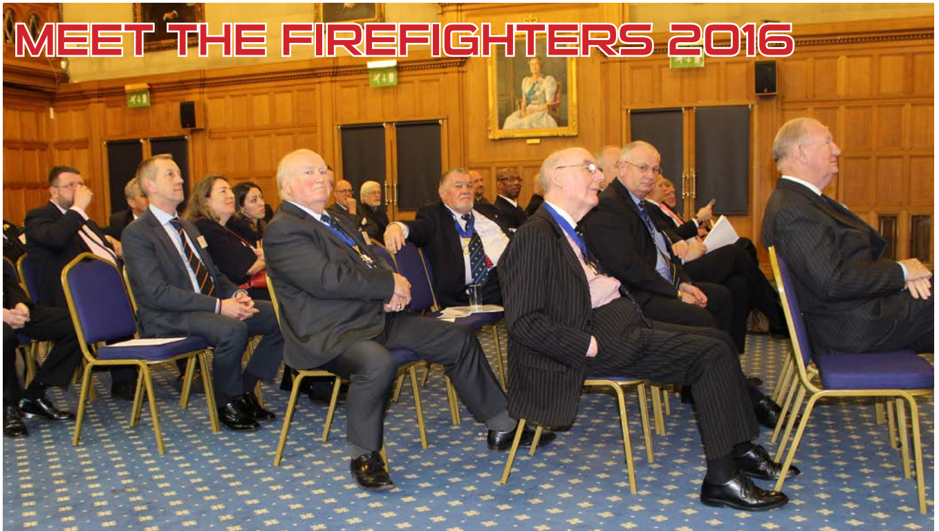
Members & invited guests attended "Meet the Firefighters" at the Insurance Hall

Meet the Firefighters is an annual event where we open our doors to invited guest to explain to them what Livery Company's are and more importantly what they are not.