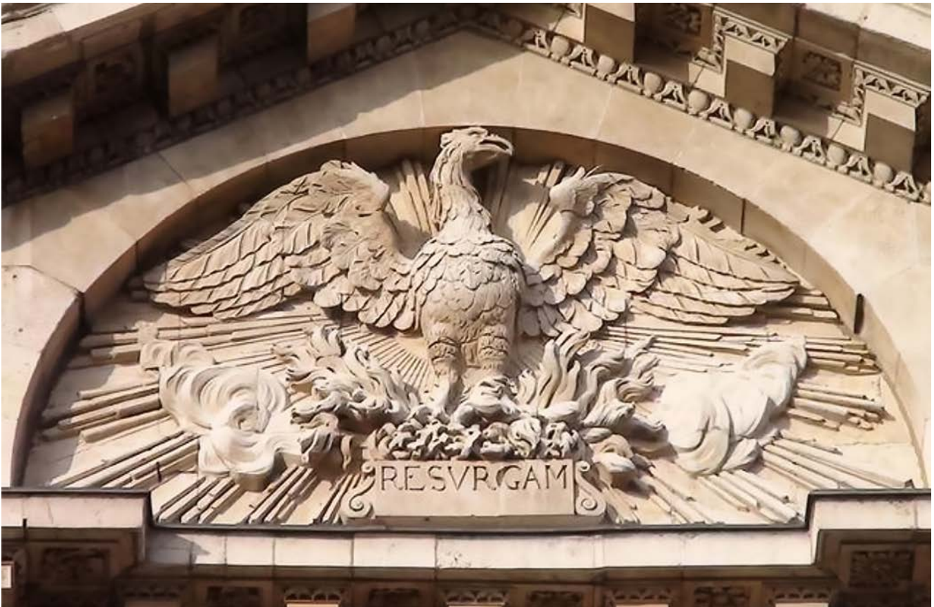
RESVRGAM: "We will rise again" The engraving above the doors to St Pauls Cathedral

A number of sources have been referenced throughout the report and the content of this report is limited by the availability of information. A number of witnesses who provided evidence to a committee established by Parliament after the fire described the fire originating at a bakery in Pudding Lane in the City of London. The fire spread to multiple structures over a four-day period. It destroyed 80% of the City of London including 373 acres within the City Walls and 63 acres outside them. The property destruction included 87 out of 109 churches, six chapels, 13,200 houses, three City gates and 44 livery halls .