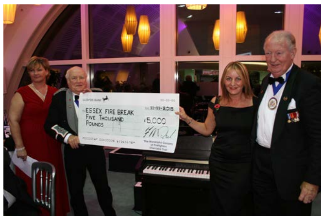
Cheque being presented to Fire-Break.