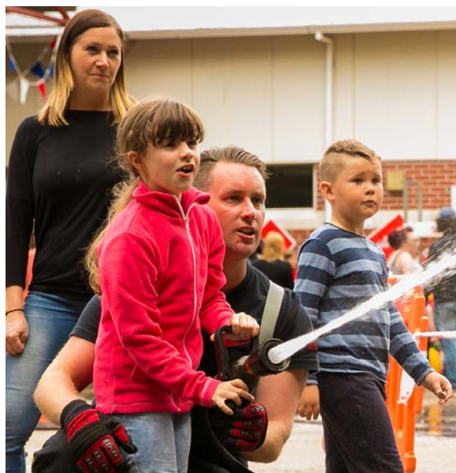
Youngsters being shown how to use the Fire Brigade equipment

There was also a smoke machine, face-painting, a Fireman Sam mascot, music, a barbecue and tea and cake.