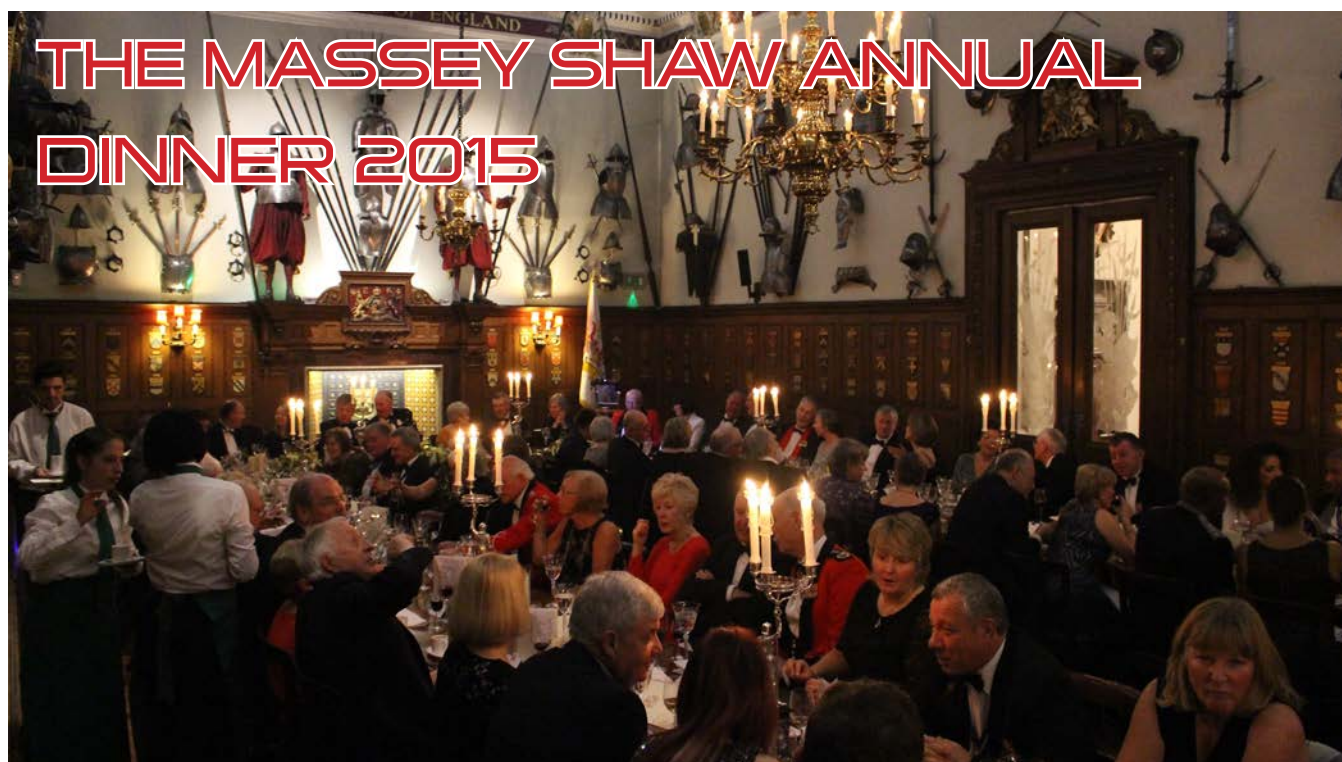
Members and Guests at The Armourers Hall enjoying the evening

The Massey Shaw Annual Dinner is held in honour of Sir Eyre Massey Shaw, who was the first Chief Fire Officer of the Metropolitan Fire Brigade. This year, the dinner was held in the amazing Armourers Hall on Wednesday 9th March. The Armourers have had a hall on their site in Coleman Street since 1346 and the Hall's striking interior features 16th and 17th Century armour, weapons and paintings. The Hall was one of the very few to escape destruction in the Great Fire of 1666, which was checked a few yards short of it. The Company is much indebted to an unknown fireman who, during the blitz of 1940, seeing the curtains of the Court Room ablaze, broke into the Hall and extinguished the flames. Although his identity may never be known, his quick thinking undoubtedly saved the Hall. The venue was a superb, historic and unique location.