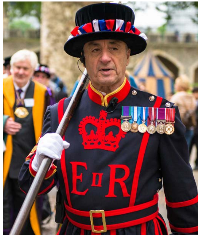
A Yeoman Warder in ceremonial dress

The Tower of London has played a prominent role in English history. It was besieged several times, and controlling it has been important to controlling the country. The Tower has served variously as an armoury, a treasury, a menagerie, the home of the Royal Mint, a