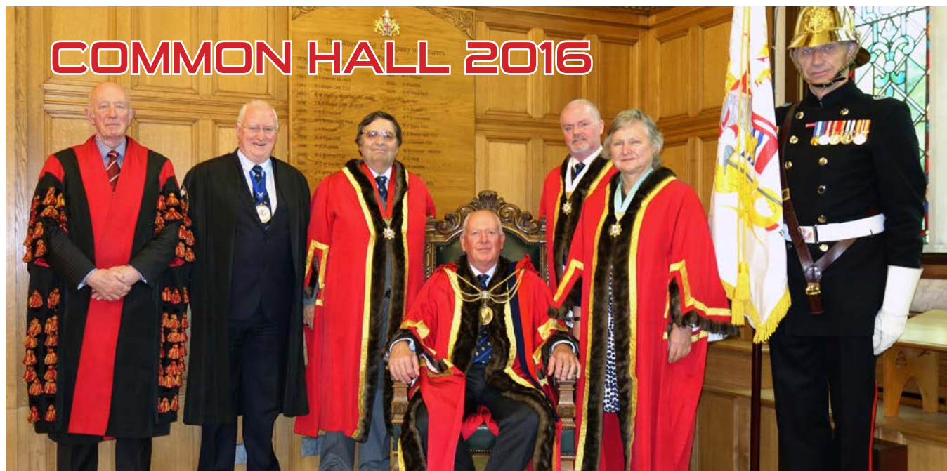
Master, Wardens and Officers of our Company 2016-17

The Company's Common Hall ceremony was held at the Insurance Hall on Friday, 01 July 2016, and was followed by a Service of Rededication at the Company's spiritual home, the Church of St Mary-le-Bow in Cheapside. Both events were well attended by Company officers, members and guests.