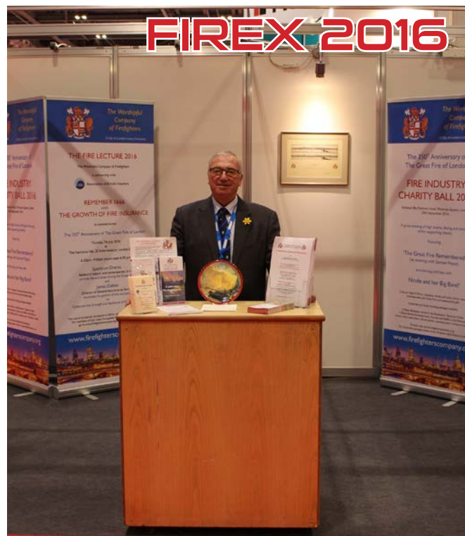
FIREX WCoFF Stand 2016

More information can be found at: www.firefighterscompany.org/firebreak