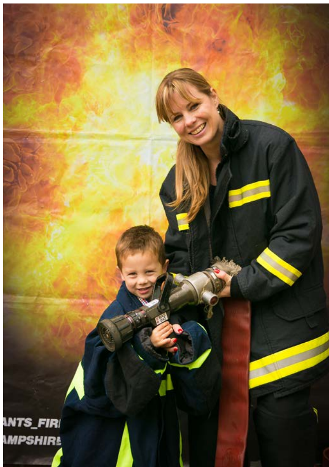
Live burns and extrications draw crowd to fundraising open day

Live burns, tower rescues and hose games were among the fire-related activities that attracted thousands to a fire station open day.